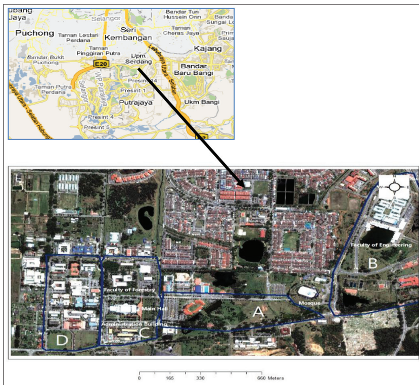
Fig.1: Study area at UPM which was divided into 4 zones A,B,C, and D

image. Roadside trees were digitized using ArcMap™ to produce a tree vector layer and each tree was given identification number and tagged on the ground. Tree inventory and hazard assessment form were prepared to assist in ground data collection. The ground data collection consisted of two parts: i) hazard assessment and (ii) tree inventory. Hazard assessment parameters were filled in the form according to the International Society of Arboriculture (ISA). ISA form format was based on the handbook “A Photographic Guide to the Evaluation of Hazard Trees in Urban Areas” (Matheny & Clark, 1994). Ground activities include collecting basic tree information such as height, tree performance, GPS location,